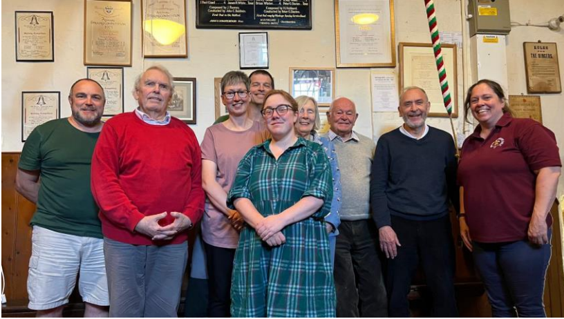
The team after the General Ringing to mark VE80, prior to the Town Crier reading the speeches made by King George VI and Winston Churchill on 8 May 1945.

The Central Council of Church Bellringers also suggested that as many bellringers as possible ring at 6.30pm on the actual anniversary of VE Day, Thursday 8 May. Wantage bellringers joined with hundreds of other churches across the country who were all ringing their bells at the same time. As we finished at 7pm we were just in time to hear the Town Crier reading the words that King George VI said in 1945, followed by the speech of Winston Churchill